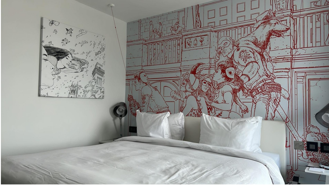
Frank Quitely's artwork in one of the accessible bedrooms in the Radisson Red Hotel