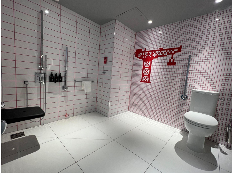
Accessible Bathroom in the Radisson Red