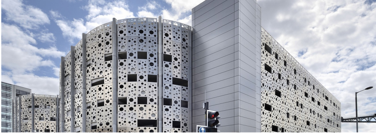
The Cheesegrater at the SEC, a masterpiece of culinary-carparking fusion.